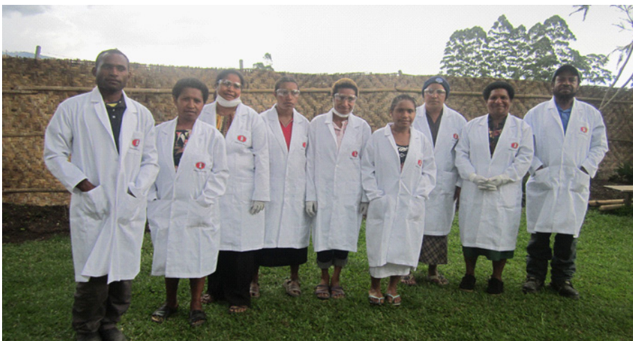
VCCT counsellors and clinicians displaying their laboratory gowns