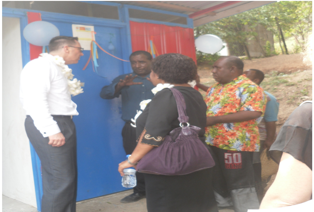
Senator the Hon. Brett Mason (Queensland-Parliamentary Secretary to the Minister for Foreign Affairs) being briefed by the Barakau Primary School Principal on the development of the WASH Project in the school

Senator Mason had only but praise for the school from cleanliness to having the best dancers. "Barakau Primary and Elementary School is the best school in PNG, most importantly because of the best hygiene and the best toilet facilities (VIP