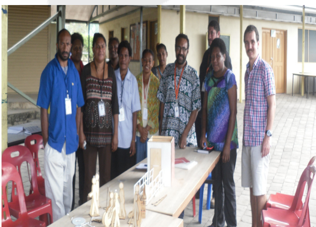
Participants stand behind their group work project after completion of the workshop.

A day workshop was organized by the Water Sanitation and Hygiene (WASH) Program team for senior and any interested staff of Anglicare PNG Inc. The workshop was facilitated by a representative from WaterAid PNG. The participants were introduced to the facilitation of people with Special Needs (People with Disabilities). They went through an interesting session of building a miniature sanitation facility for people with disabilities. The participants were given information vital to help in assisting people with special needs. Anglicare POM Branch manager on behalf of the organization and the participants thanked WaterAid PNG for the support in this capacity building exercise for staff of Anglicare. Anglicare PNG Inc. had taken onboard the WASH Program in late September 2013.