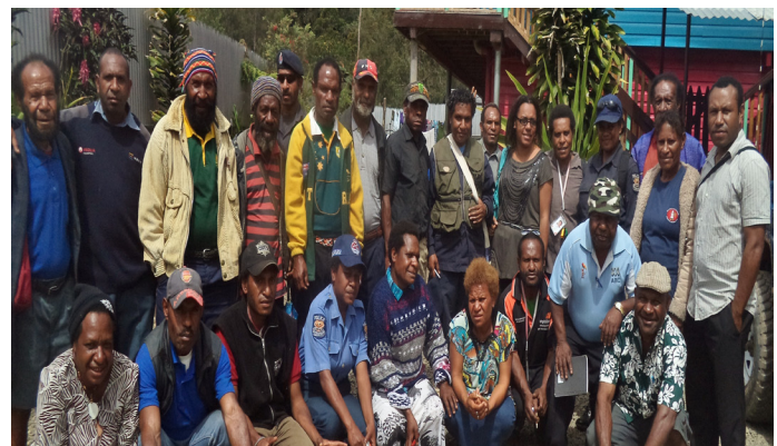
A group shot of police, magistrates, community leaders and program staff after a sensitization meeting and discussion, May 2014.

glicare branch providing technical assistance.