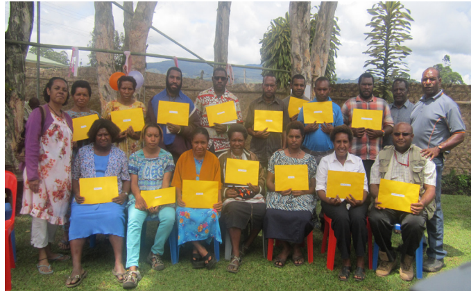
Participants at the Anglicare PNG Inc. Mt Hagen premises after the training and receiving thier certificates

Due to very big number of STI/HIV patients managed and registered at Mt. Hagen Provincial Hospital's STI/HIV clinic, Anglicare Mt Hagen branch's VCCT site was identified as Tininga Clinic's satellite site in 2013 when it was accredited by National Department of Health (NDoH). In preparation, Anglicare management recruited five Community Health Workers the same year. One of which was seconded to Kundiawa Urban clinic to help Ante Natal mothers. These people were employed, without any counselling or VCCT/PICT experience even though their work required them to do counselling. The branch's