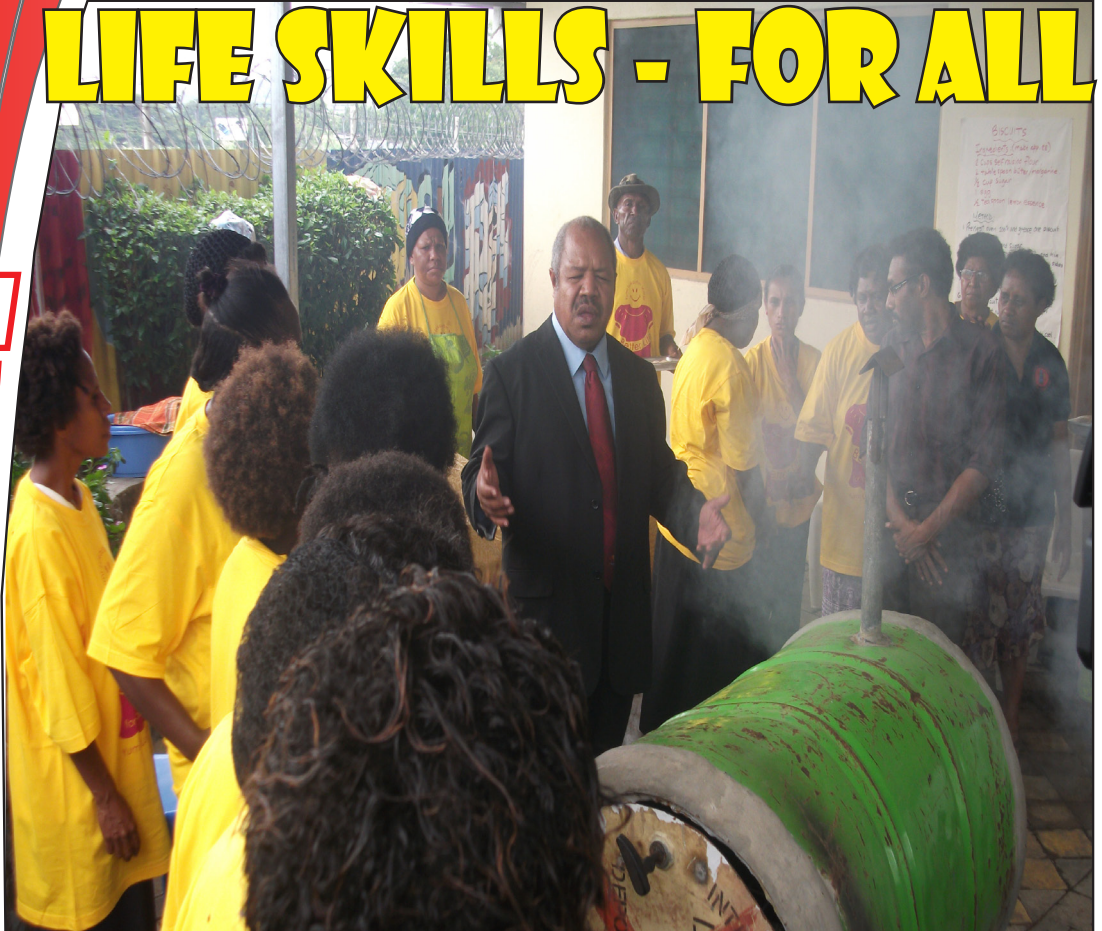
NCD Governor MP Powes Parkop speaks with the Life Skills participants. The lifeskills training is provided under the Ginigoada Bisnis Foundation Inc. and coordinated by Anglicare PNG Inc.

Churches and Civil Society Organizations play a very vital role in supporting the Government improve the quality of life here in Papua New Guinea.