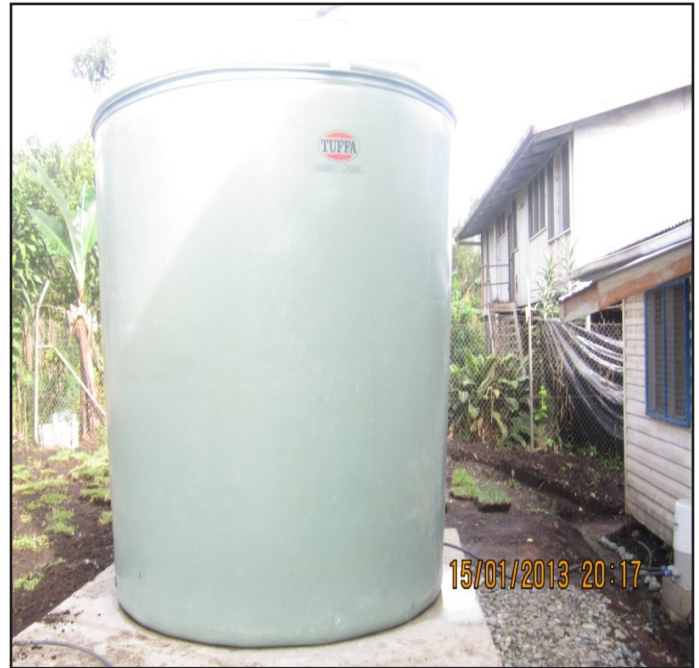
Above: Reserve Tuffa water tank installed at Anglicare MT.Hagen. Below: Sanyo electric water pump installed.

day period under the supervision of new Senior Finance Officer - Lemen Kerowa and Cliff Rombok. The branch is now using rain water from the tank and has shut the main water supply system off. Continuous water flow has boosted the morals of staffs when they returned. The security personals and casuals have constructed platforms outside the office lawn with timbers used to build water tanks concrete foundation. These seats are now used by staffs, visitors, clients and participants during FLBBS training conducted on the lawn because of the high number. Lemen Kerowa who is also responsible for security, was tasked to allocate flower plots to security guards to weed, plant new flowers and maintain throughout the year. The guards had removed all rubbish in and around the office premises. Below are areas cleaned along the fences which new flowers will be planted.