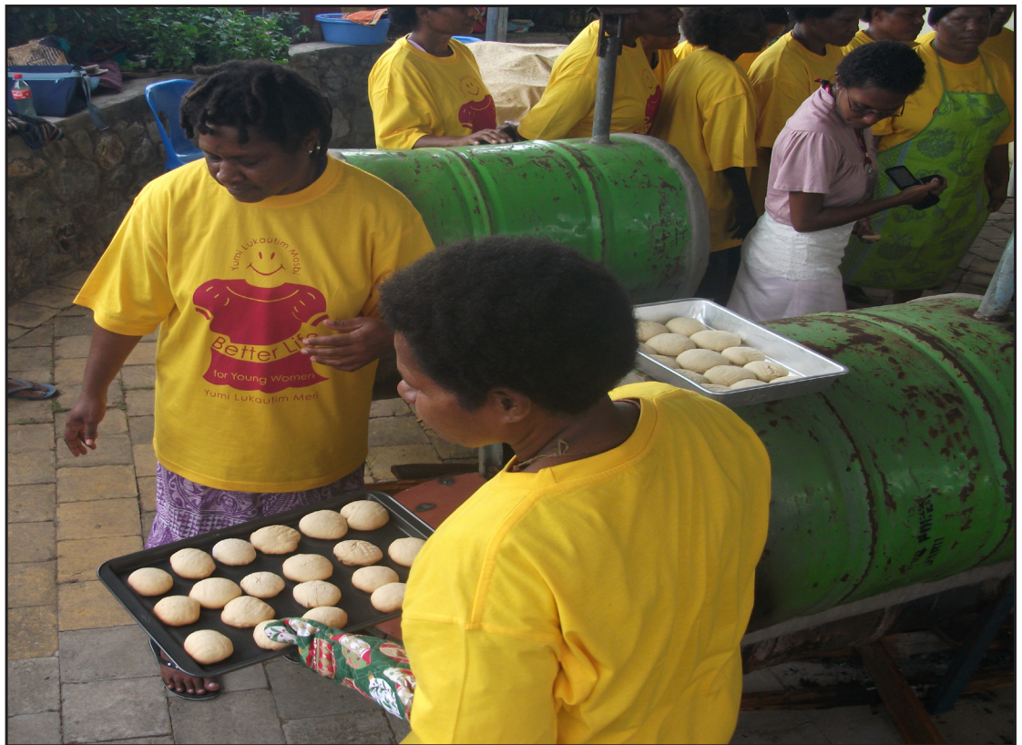
Mothers from the Life Skills training using drum oven to bake cookies and other bakery recipes to sell.