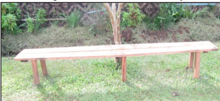
Forms constructed inside the office premises beneath the shady trees around the perimeter of the lawn

the Bishop of Diocese of Aipo Rongo was invited to open up the year with a mass.